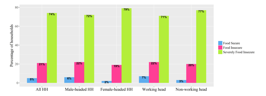
Figure 1 Food security by sex and working status of houshehold head (HH).

32.5% for more than 5 years. About a third (33.7%) lived without their father, in 40.4% of cases this was because he was either dead or missing; 7.9% lived without their mother, in 42.8% of cases this was because she was still in Syria. Nearly all working children (91.3%) cited the Syrian war as the reason for moving to Lebanon, and 84.5% of those who went to school in Syria no longer went to school in Lebanon. Moreover, for 96.3% of working children, the forced exodus to Lebanon was associated with a first child labour experience.